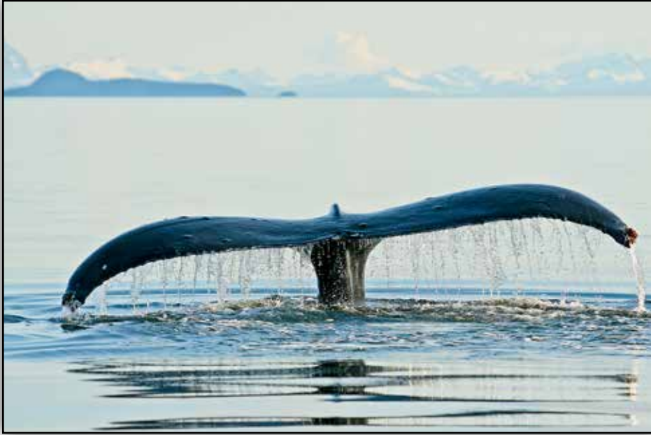
The swim deck allows water-level photos