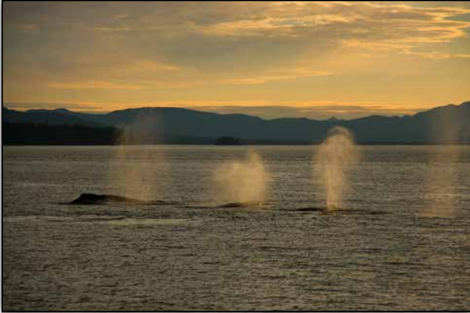
Humpback whales will be regular sightings during our trip.