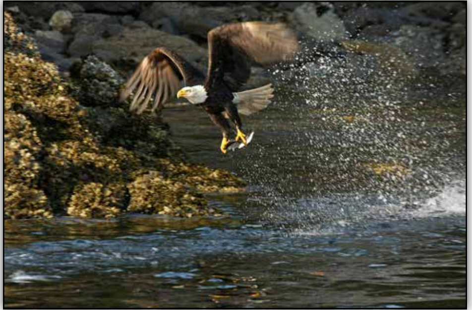
Bald Eagles are abundant in the Inside Passage

Inside the yacht we typically use slippers or stocking feet. NO OUTSIDE SHOES CAN BE WORN INSIDE. Keep soft-soled shoes handy for quick trip out onto the deck for wildlife encounters. Crocs work well for this as do most sneakers or walking shoes. Remember that it may be raining, so waterproof shoes are nice to have, but not a necessity... socks will dry quickly in the engine room!