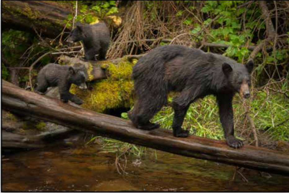
Black Bears may be found on some islands.