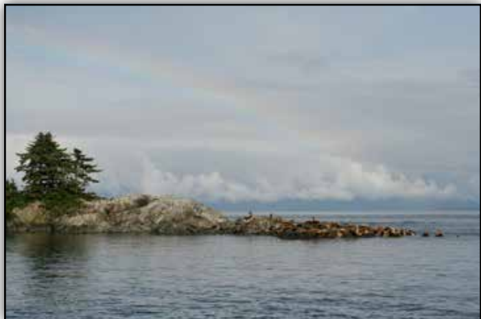
The Stellar's Sea Lion haul out along Brothers Islands is very picturesque.