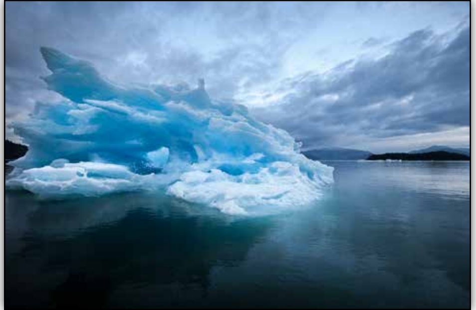
Icebergs flow from LeConte Bay after calving from the immense glacier.

Wildside Office 888-875-9453 Wildside Mobile 610-564-0941