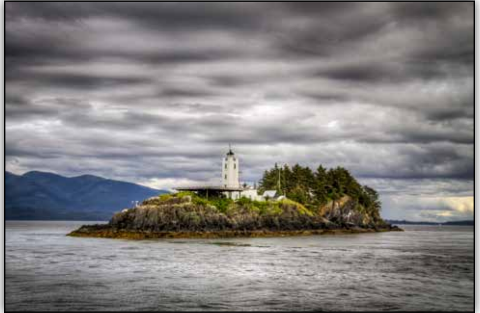
Five Fingers Lighthouse is a great location for Humpback Whales.

There is so much to see and do each day, we will never be bored... the difficulty is making choices!